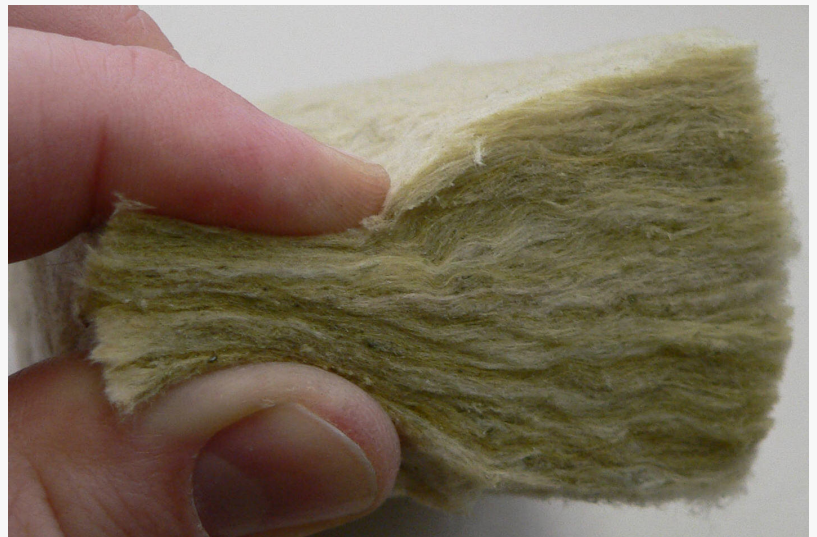
Mineral Wool Market

/EINPresswire.com/ -- The global mineral wool market accounted for USD 13.1 Billion in 2020 and is expected to reach USD 19.5 Billion by 2028, growing at a CAGR of 5% from 2021 to 2028.