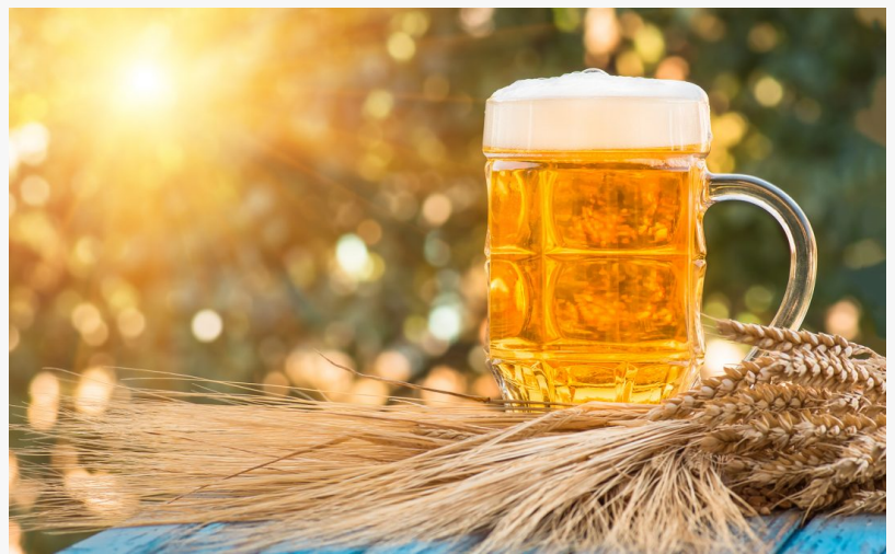
Global Malt Ingredients Market

A momentous growth has been witnessed in the past years within the malt beer market across the globe which is anticipated to upsurge the demand for malt ingredients in the coming period. Moreover, the rising significance of malt extracts as useful components in the formulation of nutritional drinks and confectionery as a result of their essential amino acid & fiber contents and vitamin B is also expected to propel the growth of the malt ingredients market. The strict regulations in relation to alcoholic beverages in several parts of the world have brought in the trend of non-alcoholic beverages. Consequently, the digit of non-alcoholic brewing companies has been rising in these regions. Apart from this, manufacturers are also emphasizing the creation of new products, with regards to flavors, like raspberry, peach, and pomegranate. Such initiatives are anticipated to bring in new opportunities for the malt ingredients market. Furthermore, the market has been anticipated to witness robust growth during the forecast period owing to the increasing demand for diverse ready-to-eat products and packaged foods.