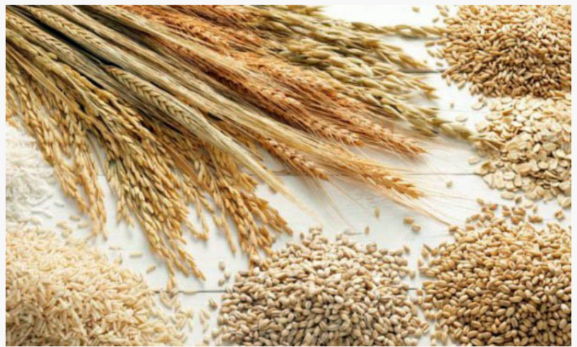
Global Malt Ingredients Market