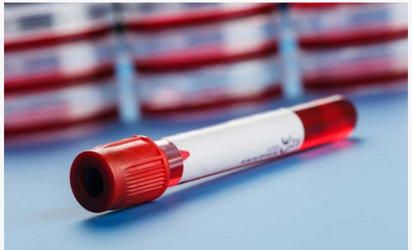
Global Blood Collection Market