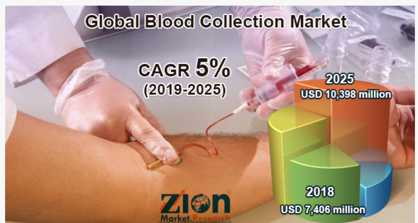
Global Blood Collection Market

the report, the global blood collection market was valued at approximately USD 7,406 million in 2018 and is expected to generate around USD 10,398 million by 2025, at a CAGR of around 5% between 2019 and 2025.