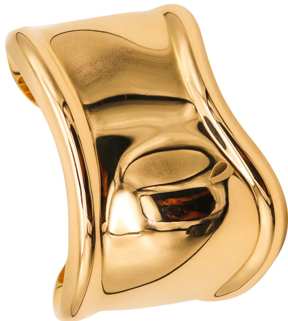
Tiffany Co by Elsa Peretti Rare Small Right Bone Cuff in 18K Gold