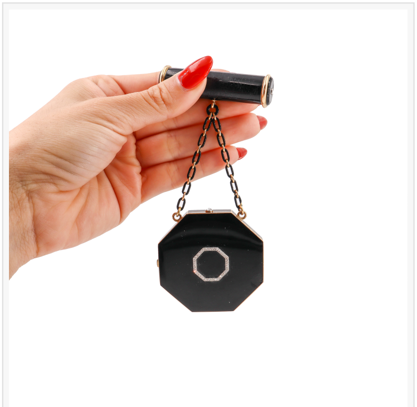
Cartier Paris 18k gold and enamel Vanity case

https://bid.winbidsauctions.com/online-auctions/winbids-auctions/van-cleef-arpels-paris-philippines-ring-in-18-kt-gold-with-diamonds-coral-3779367