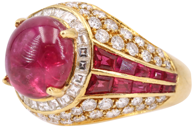
Rubies & Diamonds 18k Gold Cocktail Ring

Michael Bondanza 18-karat gold bracelet with diamonds and onyx (lot #145; estimate: $10,000 – $16,000) https://bid.winbidsauctions.com/online-auctions/winbids-auctions/michael-bondanza-18k-gold-bracelet-with-diamonds-onyx-3779393