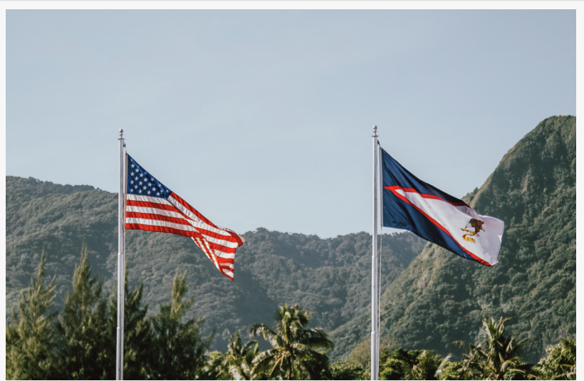
American Samoa Territory of USA