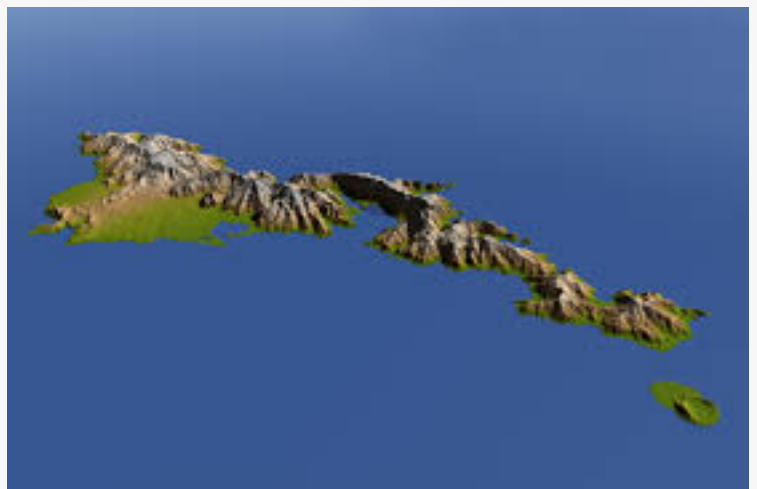
American Samoa USA