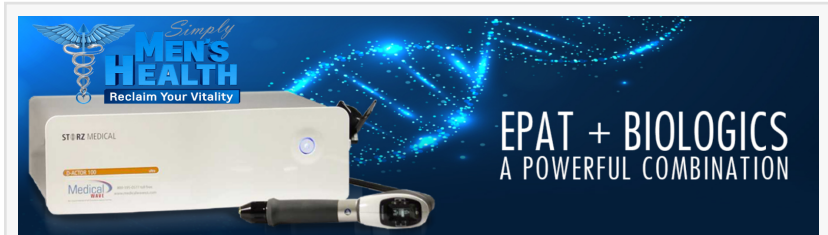
Simply Men's Health Swiss Storz EPAT Shockwave Biologics Treatment for ED, Peyronies, and Pain

BOCA RATON, FL, UNITED STATES, October 11, 2022 /EINPresswire.com/ -- Simply Men's Health, established in 2014, moves to our bigger and better East Boca Raton State-of-the-art Facility in the Carmen Care Laser Institute (our Glades Rd location is permanently closed).