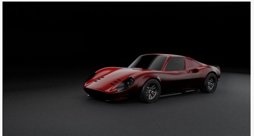
E-Cite EV GT