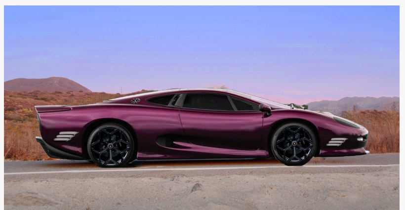
E-Cite EV 222

About VaporBrands International, dba E-Cite Motors