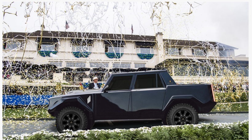
E-Cite EV Truck