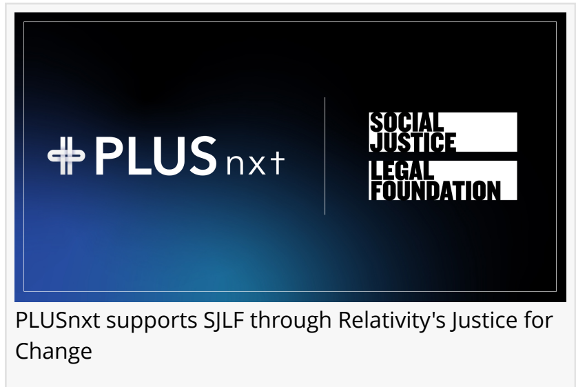
PLUSnxt supports SJLF through Relativity's Justice for Change

LOS ANGELES, CA, UNITED STATES, October 11, 2022 /EINPresswire.com/ -- PLUSnxt, leading electronic discovery services and solutions provider, announced today its designation as a Hosting Partner with Relativity's Justice for Change program. This partnership will enable PLUSnxt to provide hosting, administrative and project management support to grant recipient organizations in their use of RelativityOne.