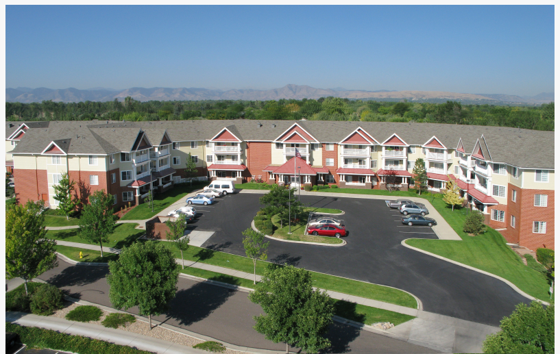
Carmel Oaks Retirement Community in Lakewood, CO