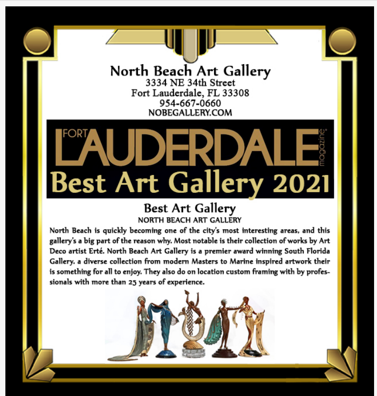
North Beach Art Gallery was voted top Art Gallery by Fort Lauderdale Magazine 2021

North Beach Art Gallery and North Beach Art and Charity 501C3 is excited to produce this very special event for their community while supporting the arts. Tickets are available on Eventbrite in