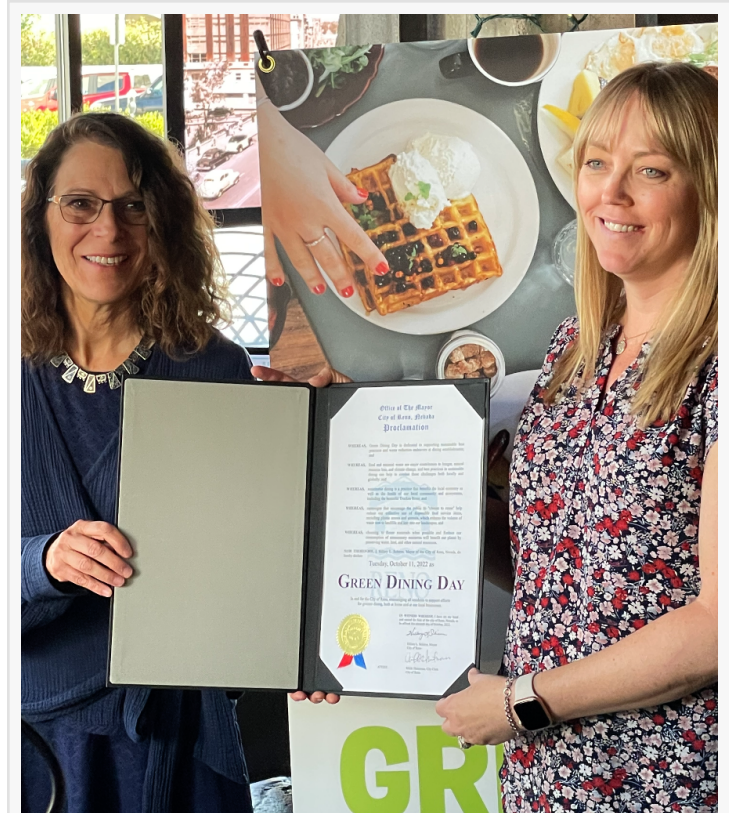
Green Dining Day Proclamation given by the City of Reno.

A community event was planned at Wild River Grille on noon, October 11, 2022; Mayor Hillary Schieve proclaimed October 11 as Green Dining Day. The invited public was asked to pledge to support sustainable dining, register to receive green dining tips, and receive information on green events and notifications for new green-friendly restaurants. A website was launched to promote restaurants and committed community members: https://www.greendiningnv.com/ .