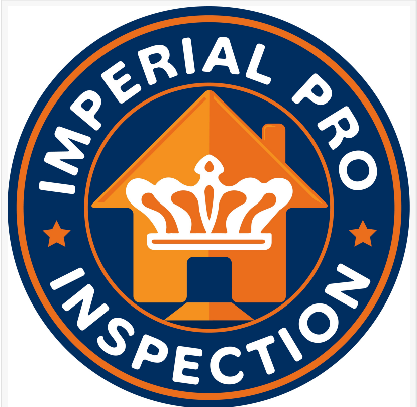
Imperial Pro Inspection Astros Theme Logo

RICHMOND, TEXAS , UNITED STATES , October 12, 2022 /EINPresswire.com/ -- Imperial Pro Inspection, one of Houston's leading home inspection companies, is now targeting homeowners to encourage regular home maintenance inspections. Most homes are not inspected by licensed inspectors and homeowners are not aware of problems until problems arise. With no additional profit motive, Imperial Pro will bring an unbiased approach to home maintenance inspections that homeowners can trust.