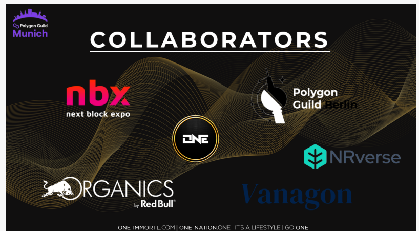
Munich Guild collaborators