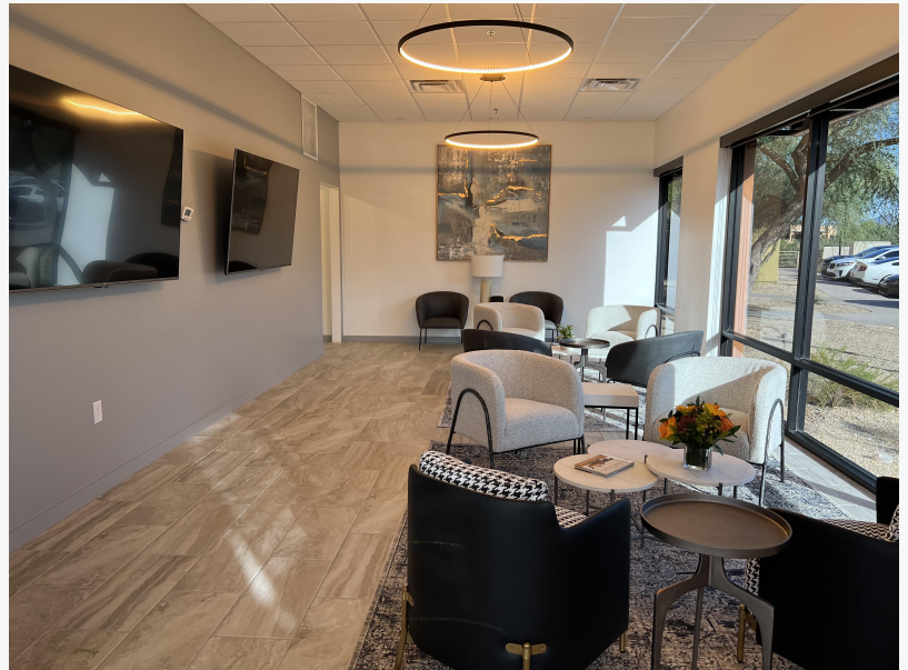
R3 Medical Training Lounge