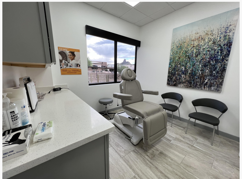
Modern Exam Rooms