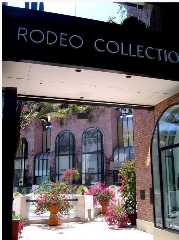
The Rodeo Collection is in the heart of the Beverly Hills Golden Triangle.