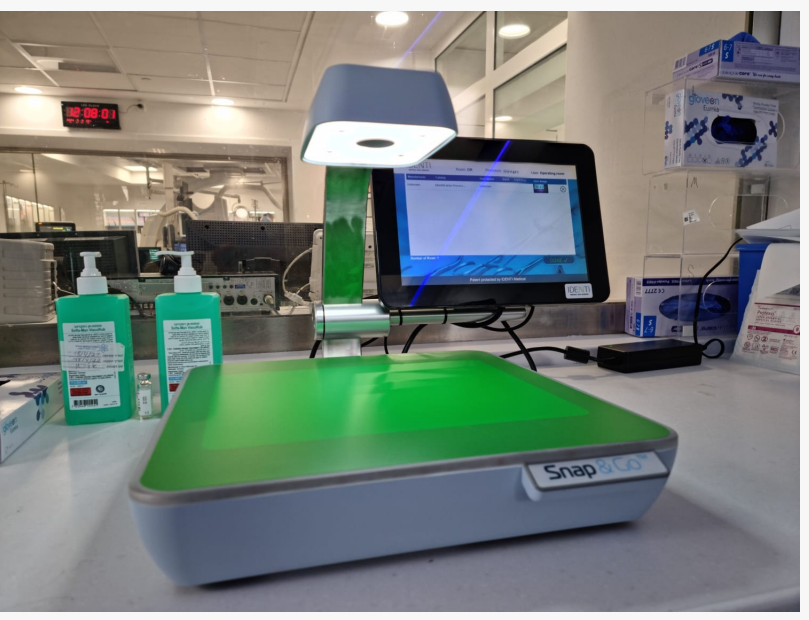
Snap & Go Image Recognition for Product Safety- by IDENTI Medical

Snap & Go uses computer vision technology at the clinical interface, with nurses simply needing to take a quick 'snap' of product packing – then the managing system does the rest. IDENTI's cloud software is powered by AI technology and machine learning, and connects to a global SKU database. Fully interoperable, Snap & Go documents UDI and achieves full charge capture for ALL types of supplies - including items not on the Item Master, such as trunk stock, and small consumables such as nuts, bolts and screws.