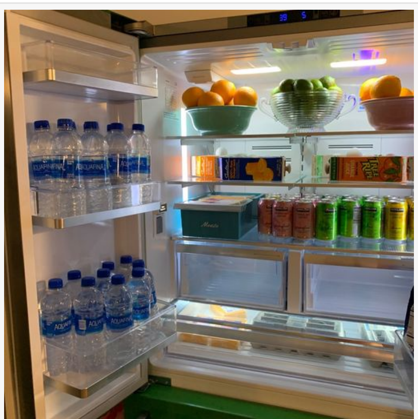
AjMadison's Community Fridge Interior

provides social media supportive materials for participating partners and encourages the public to participate by following @ajmadison and sharing the hashtag #ajcommunityfridge to increase visibility to community organizations for the available refrigerators. The company's goal is to place 100 refrigerators in the continental USA by Earth Day 2023, to support community fridge projects scattered throughout the county. People seeking to place a 'Community Refrigerator' and learn more about the year-long project, can request a donation at https://www.ajmadison.com/p/community-fridge-initiative-signup/ .