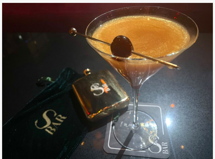
The decadent King Midas cocktail featuring liquid gold and a custom flask gift for the patron

Each S Bar reflects the character and edginess of each location and the creatives who inhabit them with sophisticated interiors, world-class cocktails, rare spirits, and deliciously elevated bar menu. A Hollywood classic originally conceived by Phillippe Starck, S Bar was imagined as an intimate neighborhood bar, striking the perfect balance between culture and sophistication and raw elegance, evoking the spirit of an artist’ gallery. S Bar embodies casual elegance, sensuality, and a sense of belonging.