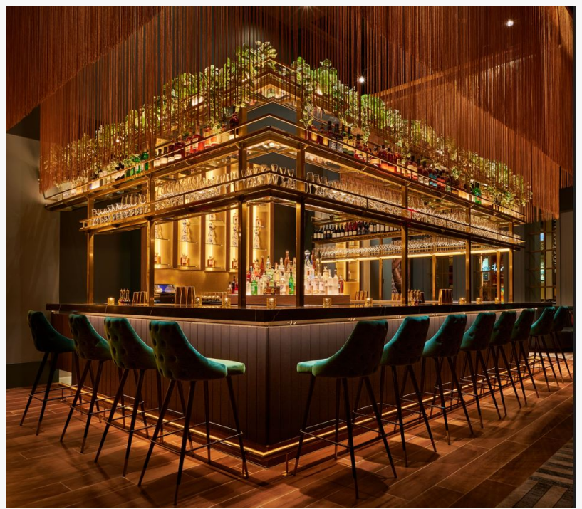
An interior view of S Bar Las Vegas at Mandalay Bay

offerings from the extensive menu include the Second Rodeo featuring a live flame presentation (Green Chile Vodka, Spiced Hibiscus, Lime, Rose Kombucha) and Blood Orange Basil (Gin, Blood Orange Juice, Basil). For the more engaging cocktail enthusiast, S Bar offers the extravagant Midas' Manhattan ($80.00) — an impressive cocktail fit for a king, topped with gold and served with a luxurious surprise gift for the guest. The That's What I Like cocktail offers unlimited strawberries and champagne for the duration of one's visit and providing for the ultimate late-night offering.