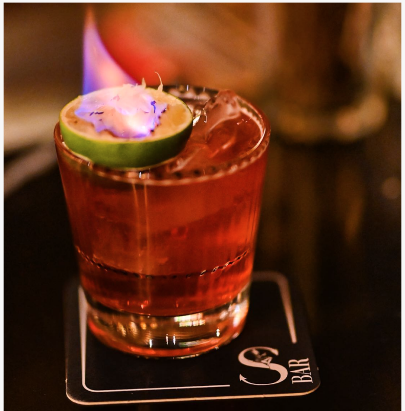
The Second Rodeo signature cocktail featuring a live flame presentation