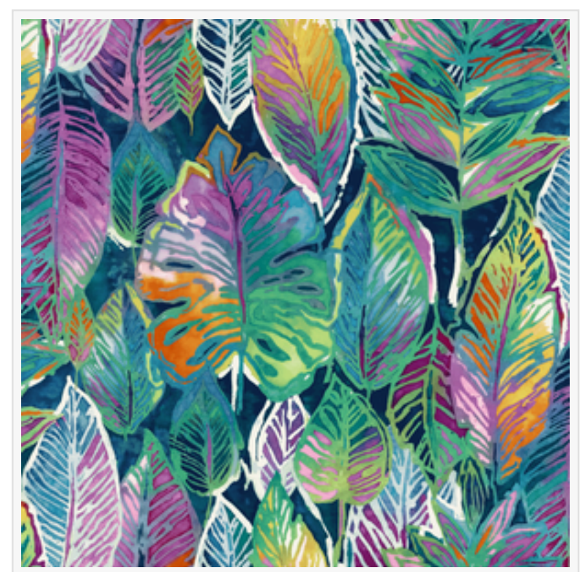
'Akala (Pink) Collection

The company's 2022 'Akala (Pink) collection is available at their Surf Line Hawaii International Marketplace location and their Jams World Kings' shops, Keauhou Shopping Center and the Shops' at Mauna Lanis location. It is also available online at <a href="https://www.jamsworld.com/collections/akala-pink-collection">https://www.jamsworld.com/collections/akala-pink-collection</a>