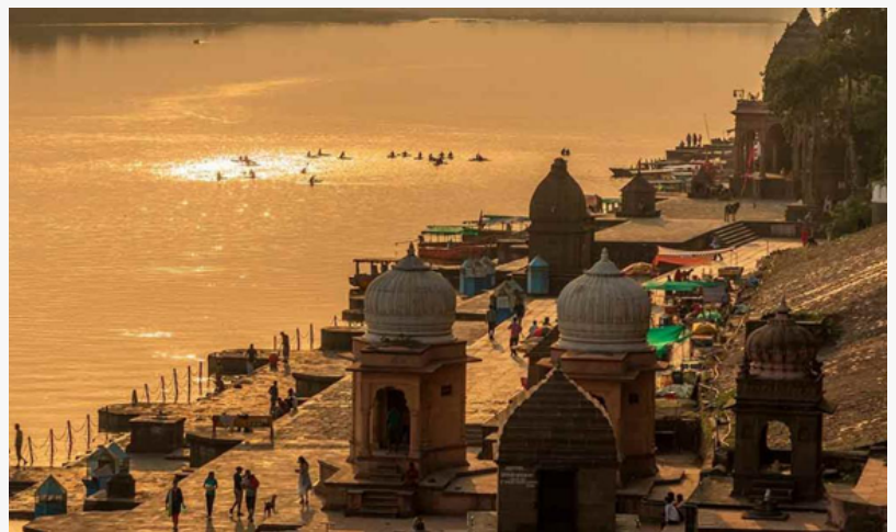
The divine town of Maheshwar