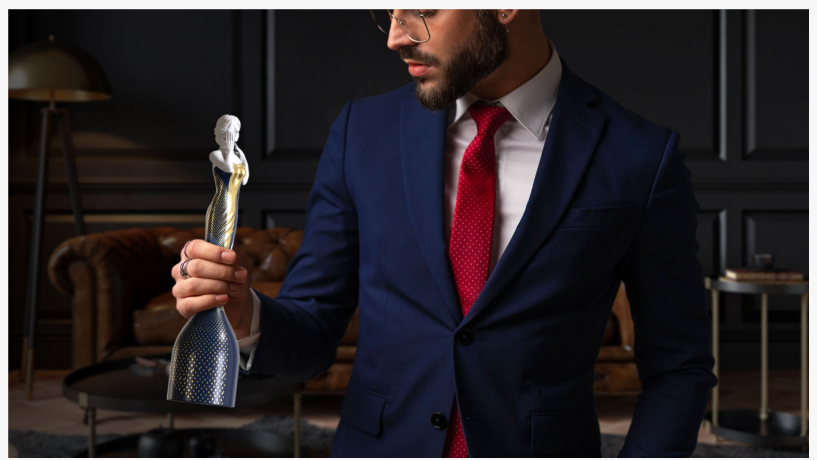
2023 MUSE Hotel Awards Statuette

Established in 2015, the International Awards Associate (IAA) is the organizer of MUSE Creative Awards, MUSE Design Awards, MUSE Hotel Awards, MUSE Photography Awards, Vega Digital Awards, NYX Marcom Awards, NYX Game Awards, NYX Video Awards, TITAN Business Awards, TITAN Property Awards, TITAN Women in Business Awards, LIT Talent Awards, LIT Commercial Awards, iLuxury Awards, NY Product Design Awards, New York Photography Awards, London