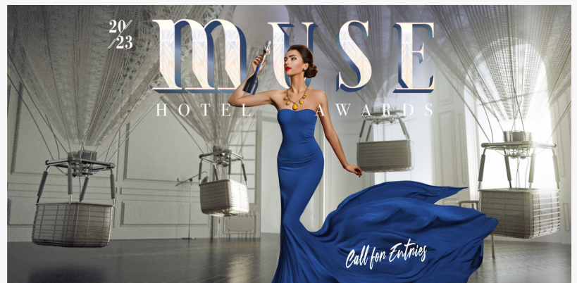
2023 MUSE Hotel Awards Call For Entries

“And now, it is time to remove the restraints on luxurious culminations and see these ambitions be materialized into a sanctuary that not only defied all conventions, but also one that continues to set the industry trend.”