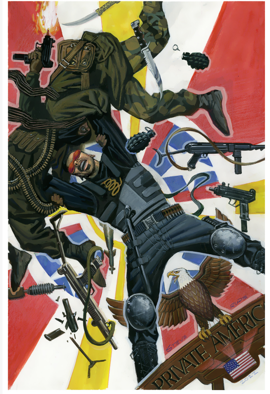
Variant cover by Steve Rude

This press release can be viewed online at: https://www.einpresswire.com/article/595719382