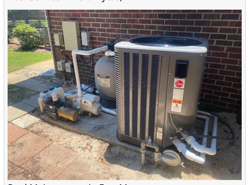
Pool Maintenance in Fort Myers