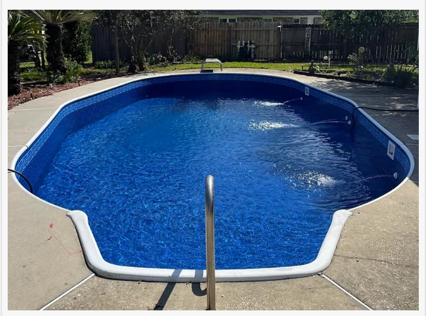
Pool Service in Fort Myers, FL