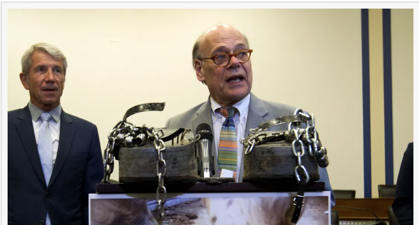
Rep. Steve Cohen speaks alongside Rep. Kurt Schrader, D-Ore., at a July 2019 press conference on the Prevent All Soring Tactics (PAST) Act to end the soring of Tennessee Walking Horses

“Whether he’s fighting to stop cruelty to horses, dogs, or wildlife, he’s the leader the nation needs on these issues.”