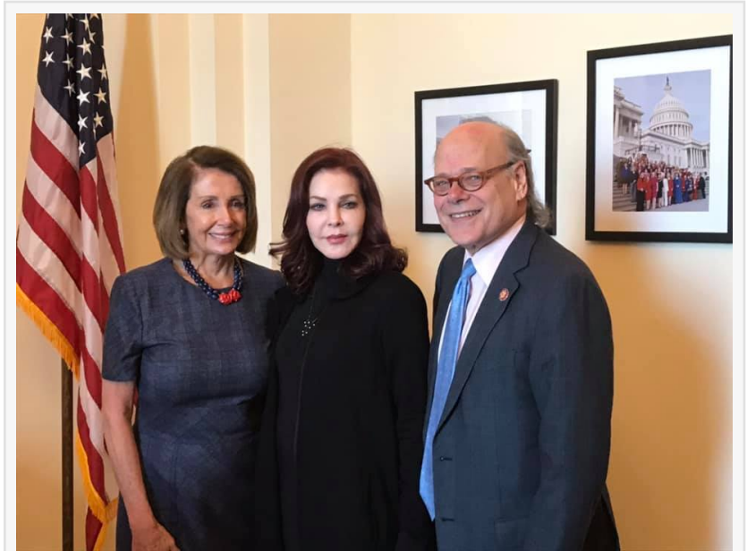
Rep. Steve Cohen discussing horse protection issues with House Speaker Nancy Pelosi and Priscilla Presley in January of 2019

• Cohen cosponsored the MINKS Are Superspreaders Act to end mink farming in the U.S. as