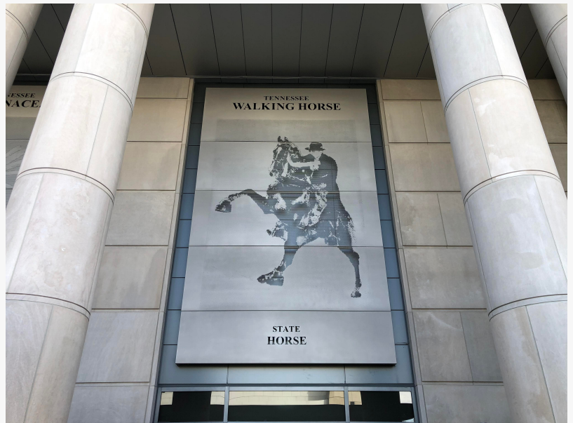
Tennessee State Archives Building Displays 'Big Lick'