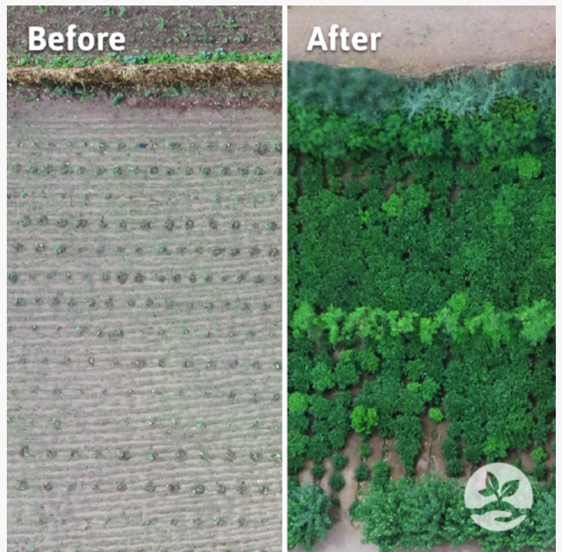
TREES Forest Garden Before and After

TREES' signature methodology, the Forest Garden Approach, helps farmers transform their land with thousands of fast-growing, ecologically appropriate trees and dozens of other crops, creating new possibilities for themselves and their communities.