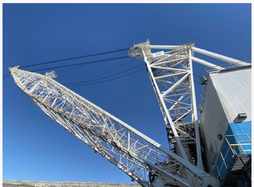
Marion 8200 Super – During Applied Fiber Main Pendant Inspection 7th year in operation

The first-installed set of cables have seen over 1350 peak load cycles daily which equates to over