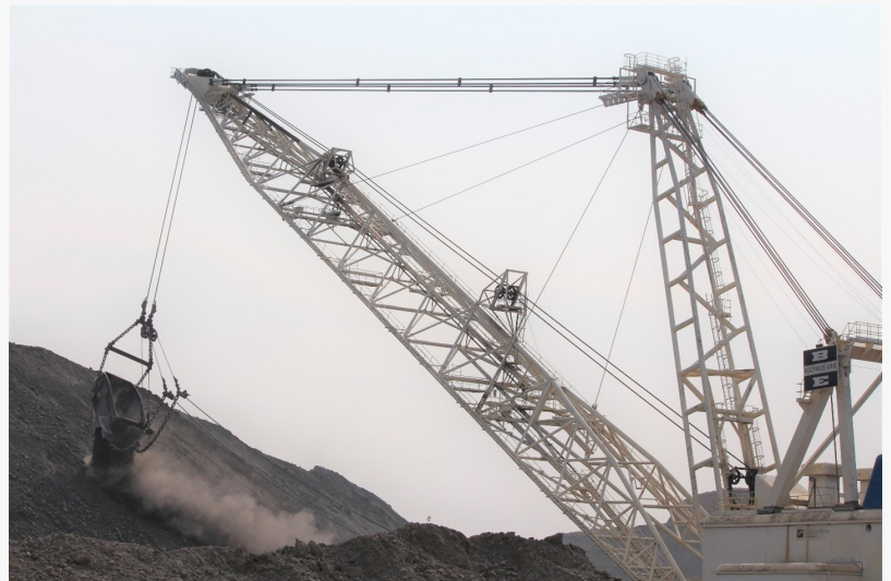
A Bucyrus 1570 Dragline Equipped with Applied Fiber Synthetic Main Boom Support Pendants