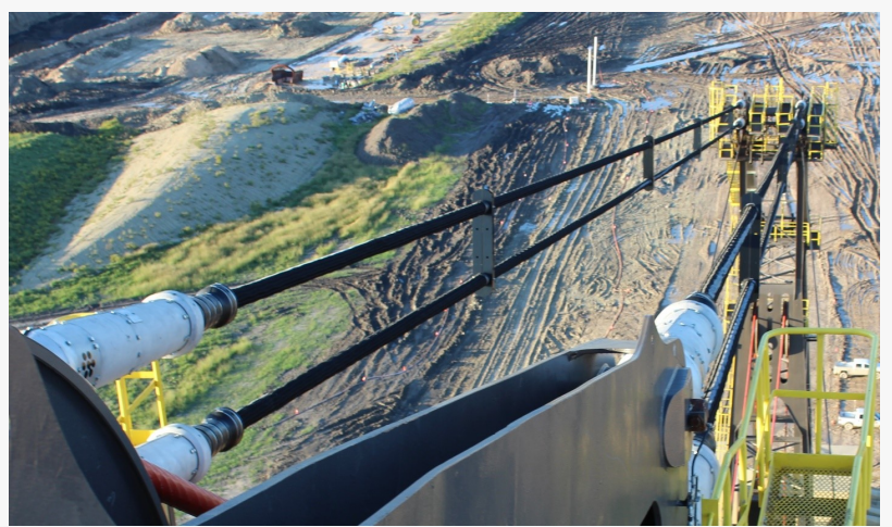
Looking down from the Boom Tip- Applied Fiber Pendants on Marion 8200 Dragline

Visitors can see the difference from a distance and our operators appreciate how much it quiets the machine movement down. One of our operators went from having numb hands at the end of a shift to having no issues – the difference both in the cab and outside the machine is very noticeable. Putting a low-mass dampener into the boom makes all the difference.