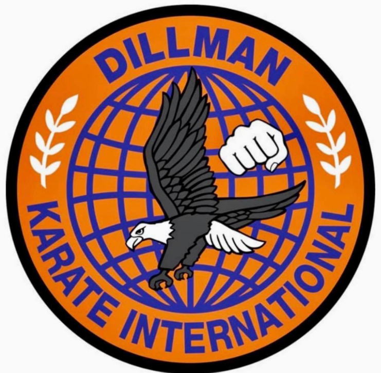
Dillman Karate International Crest