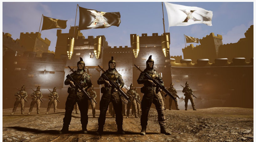
X Meta Fort A New Social Hub