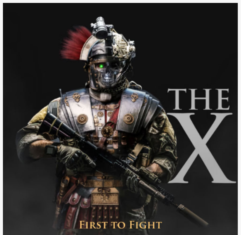
Ascend to the Metaverse

The X NFT collection includes 9 Legendary Commanders and so far Joan of Arc, Leonidas, Alexander the Great, and George Washington have been resurrected and purchased on the Ethereum blockchain.