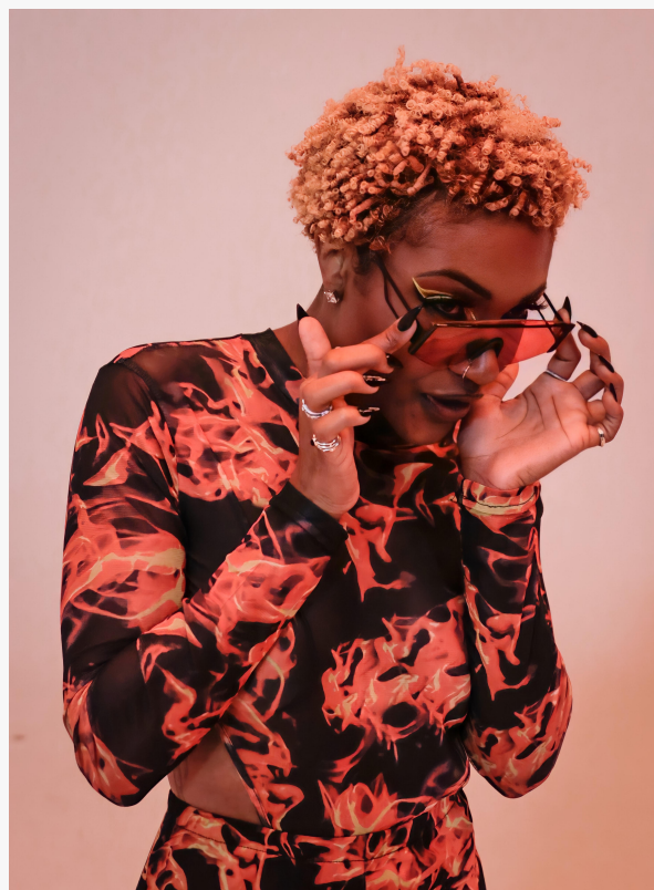
Tootsie The Rapper Coming In Hot