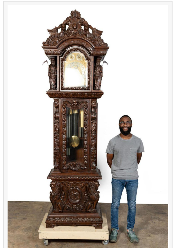
Carved walnut tall case (or grandfather) clock, made in the last quarter of the 20th century in the Renaissance Revival manner of R. J. Horner, with an earlier Tiffany movement (est. $6,000-$8,000).

A large 19th century figural Black Forest clock and cylinder music box with a case signed by C. V. Bergen of Switzerland, 44 inches tall, surmounted by a group of three stags on a rocky outcropping with two foxes crouching below, should fetch $8,000-$16,000; while a second quarter 20th century monumental Art Deco carved alabaster Iceberg floor lamp, multi-tiered, with polar bear and seal figurines, 81 inches tall, unmarked, has a pre-sale estimate of $4,000-$6,000.