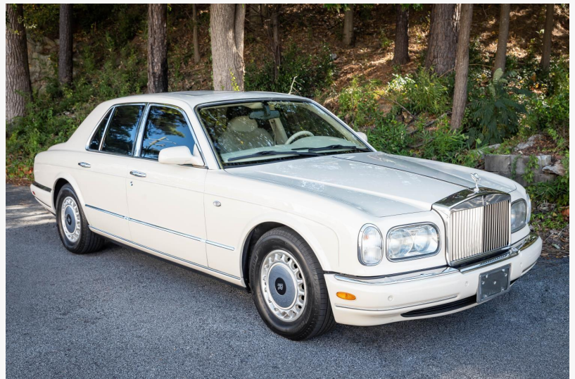
Gorgeous silver year 2000 Rolls Royce Seraph luxury car in remarkable condition (est. $35,000-$40,000).