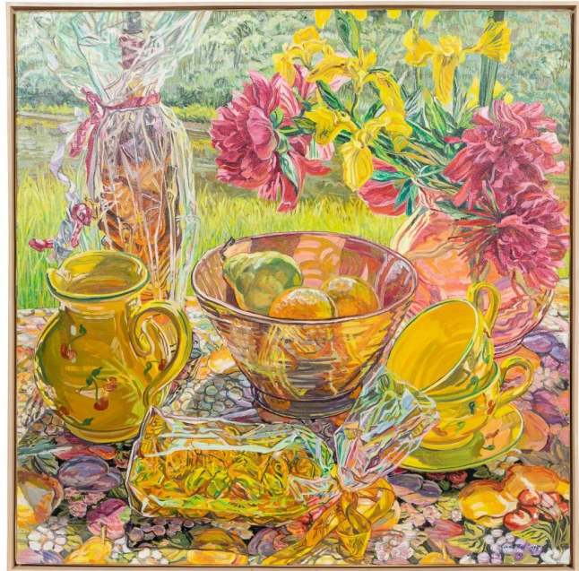
Vibrant oil on canvas picnic still life painting by Janet Fish (American, b. 1938), titled Provence , (1995), 50 inches square (sight, less frame), signed and dated lower right (est. $30,000-$60,000).

The Janet Fish picnic still life from 1995, titled Provence , depicts vessels, fruit, wine, and flowers on a blanket in the grass. The painting, 50 inches square (canvas, less frame), is signed and dated lower right and has several gallery labels on verso. It's expected to sell for $30,000-$60,000. Janet Fish is a contemporary American realist artist. Through oil painting, lithography, and