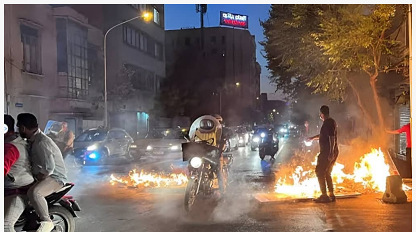
Iran's revolution sees more cities where protesters confront security forces.

PARIS, VALDOIS, FRANCE, October 15, 2022 /EINPresswire.com/ -- Iran's nationwide uprising continues on Saturday, marking the 30th day of the relentless protests, despite the regime's heavy crackdown on people from all walks of life. The restive city of Sanandaj, the capital of Kurdistan Province, and Saqez, the hometown of Mahsa Amini, and Mahabad saw many of its merchant's close shop and continue their general strike against the mullahs' regime. Strikes were also reported in the cities of Bukan and Ilam.