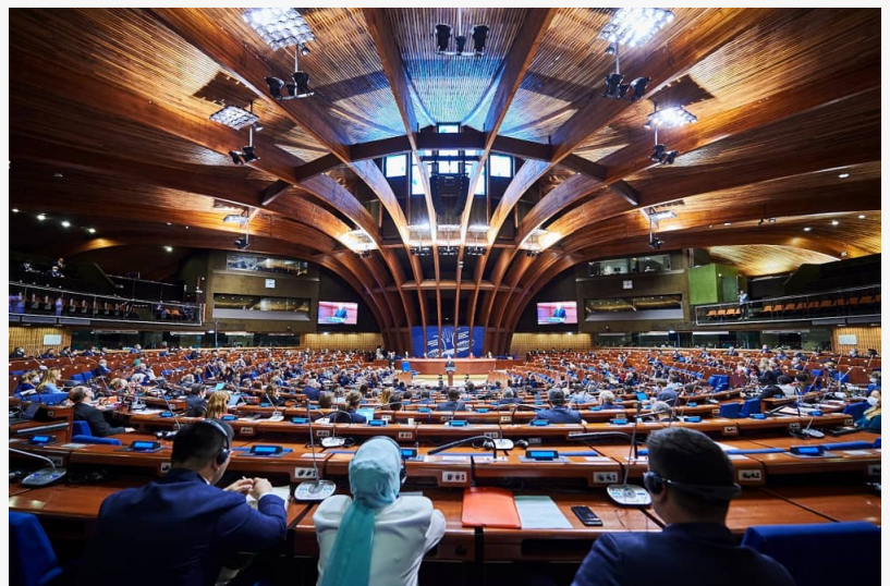
MEPs Call on European Council Members to Support Free Iran.

Protests were also held in Arak, Markazi province, the people held a large demonstration and chanted slogans against the regime, including, “All these years of crimes! Death to the mullahs’