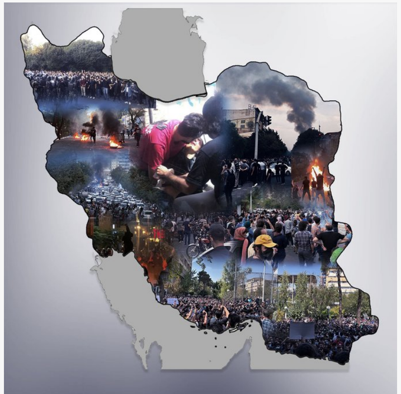
Iran's nationwide uprising continues on Saturday, marking the 30th day of the relentless protests, despite the regime's heavy crackdown on people from all walks of life.