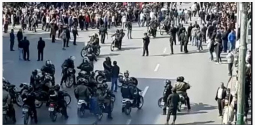
Iran's cities respond to Khamenei with even more protests.

Many cities checkered across the country were also scenes of anti-regime protests on Friday, with several areas reporting clashes between locals and the regime's security forces well into the