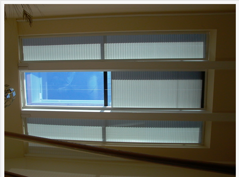
Skylight motorized shade

Skylight screens can also cut down unwanted heat, and dramatically decrease unpleasant noise during heavy rainstorms all while providing a beautiful clear view of the sky above. Bravo Skylight Retractable Screens consist of a new stronger sliding screen mesh, with an aluminum frame structure.