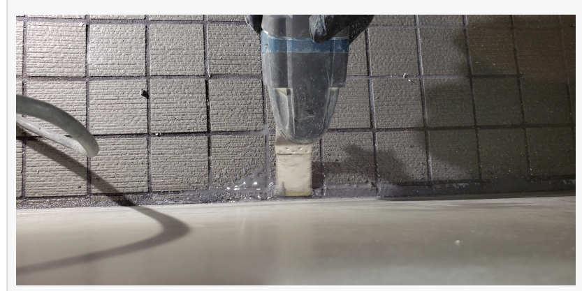
Grout repair, cleaning showed damages and water damage

The best thing to do though is to have the tile and grout cleaned on a schedule, rather than waiting to see if the floor is dirty. Waiting to clean anything allows for not only the build-up of dirt, dust, and grease, but the growth of the various microbes that consume those things as well, bacteria, germs, dust mites, and more. In order to combat these microscopic creatures and keep the house properly cleaned and disinfected, regular professional tile and grout steam cleaning is a necessity.