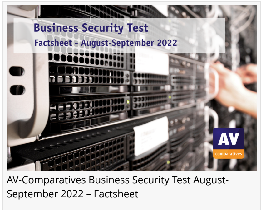
AV-Comparatives Business Security Test August-September 2022 – Factsheet

Independent ISO-certified security software evaluation lab AV-Comparatives has released the latest test results from its Business Main-Test Series , which evaluates a range of antivirus products in enterprise environments. The published factsheet includes results from the ongoing Enterprise Main-Test Series, which includes Real-World Protection and Malware Protection tests for August and September 2022.