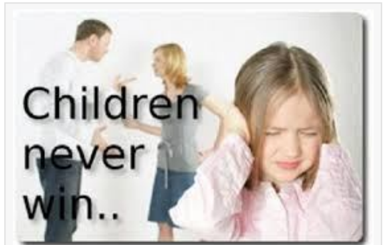
Children are hostages between feuding parents

This appears to be one of thousands of stories across the United States. Children who suffer this plight are used as props to advance a system that violates the dignity of their existence. A 9-year-old, after her mother's demise, faced the dilemma of being given custody of her father with drug-related issues. The child's aunt fought for custody because the drug problem was the reason her sister had left the marriage. Besides, the child's father had not made any effort to visit the child in over a year while maintaining contact with drug addicts.