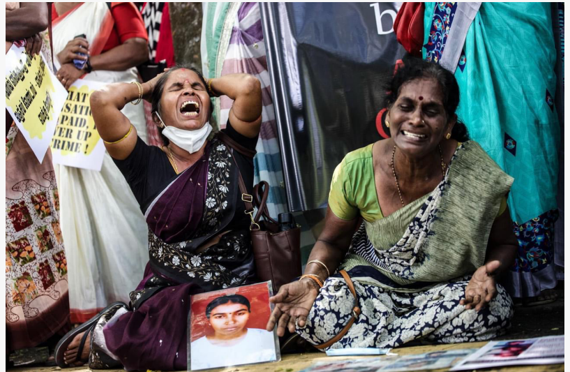
Tamil Mothers Seeking their Disappeared Babies Protest Outside UN in Colombo