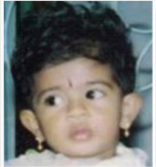
3 years old when Disappeared

https://english.theleader.lk/news/564-tamil-mothers-mark-children-s-day-with-list-of-kids-taken-away-by-military