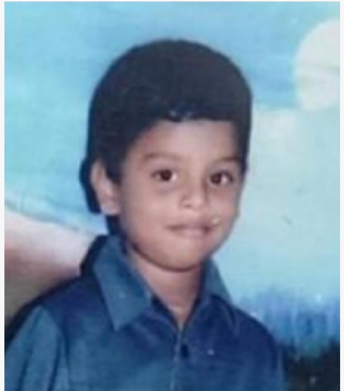
10 years old when Disappeared