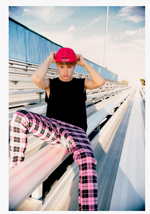
Music artist Mackenzie Sol

This press release can be viewed online at: https://www.einpresswire.com/article/596467945