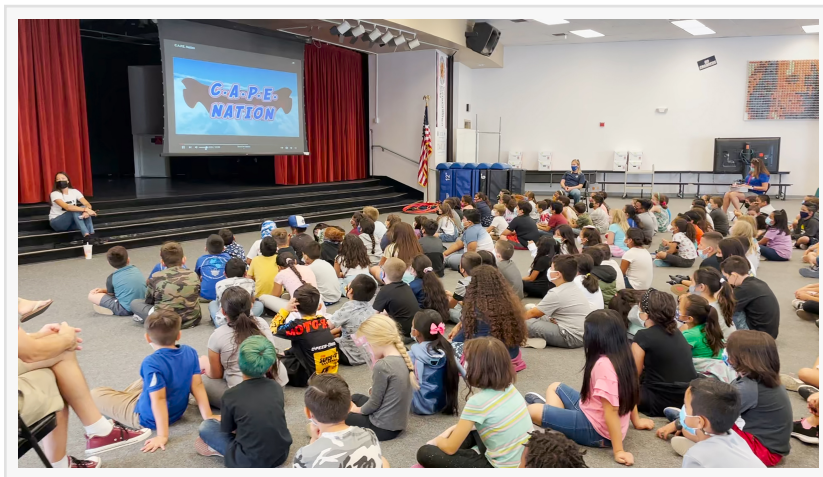
A recent Boo2Bullying teen workshop

LOS ANGELES, CALIFORNIA, USA, October 21, 2022 /EINPresswire.com/ -- Boo2Bullying is excited to announce its inaugural Los Angeles BOO BALL, slated to take place October 28th, 2022 from 6PM-11PM at SLS Beverly Hills. With a mission to eradicate bullying, intolerance, and discrimination, Boo2Bullying works to educate kids, schools and parents about acceptance,