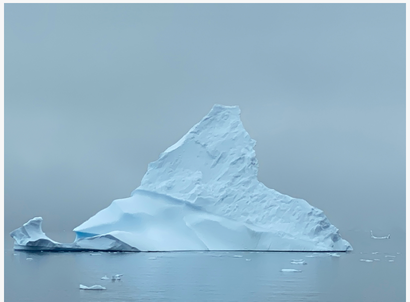
Fragmentation of Antarctica