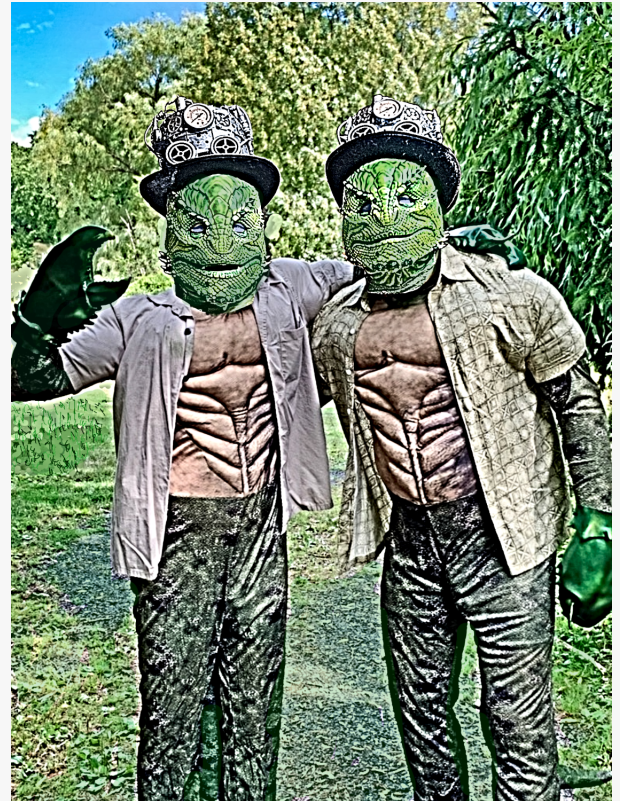
Hanging out during one of our first visits to Earth during the Precambrian

the powerful reptiles by the world's many cultures: whether as the snake in the Judeo-Christian