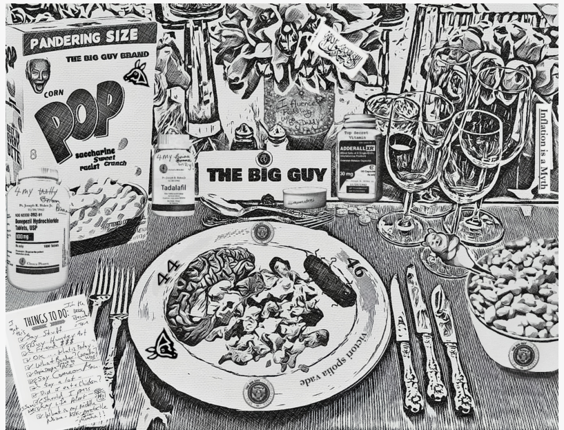
Big Guy Biden scrambled brains and eggs breakfast.