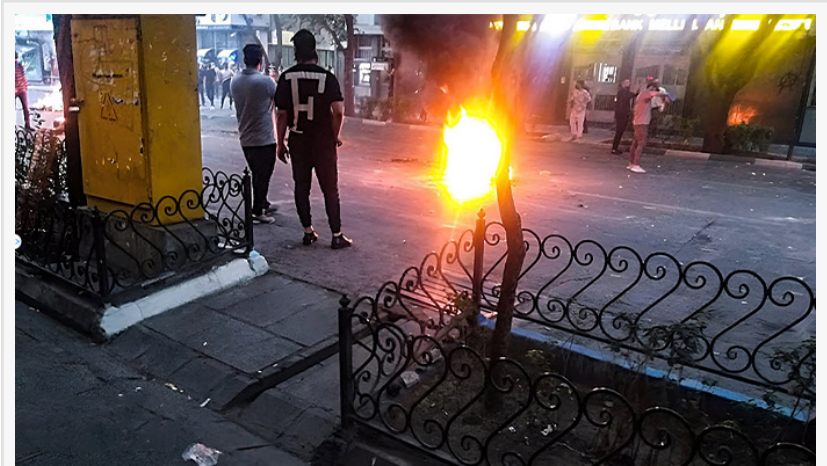
Iran's anti-regime protests continue as revolution enters its second month.

were chanting “Death to Khamenei!” in the prison yard. Sirens and gunshots could be heard from outside. At around 10 am local time, 50 prison guards were stationed on the rooftops of the prison's buildings with firearms and were aiming at the inmates. The prison warden was seen on the rooftop, shooting birdshot with a shotgun. This incident comes merely two days after a massive crackdown in Evin Prison, in which the regime has killed and injured numerous