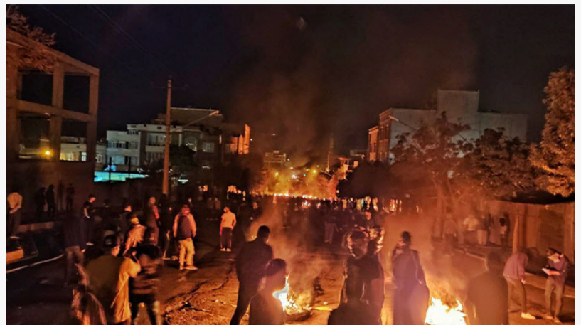
Iran's revolution sees more cities where protesters confront security forces.