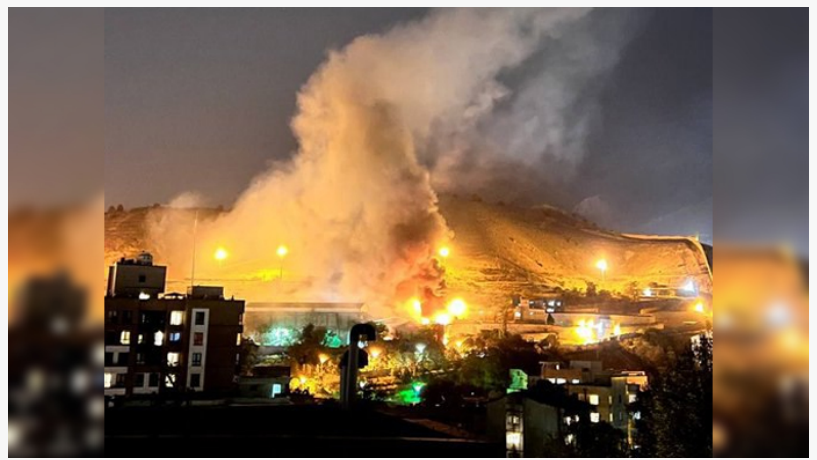
Iran's Revolution escalates with major attack on Tehran's Evin Prison.

The NOPO unit members were also seen throwing a number of the inmates of the Evin rooftop, the eyewitness report adds. They were also targeting inmates in the prison yard with live bullets and pellet rounds. One inmate looking into the prison yard from a window was hit with a live bullet that wounded his side, the report continues.