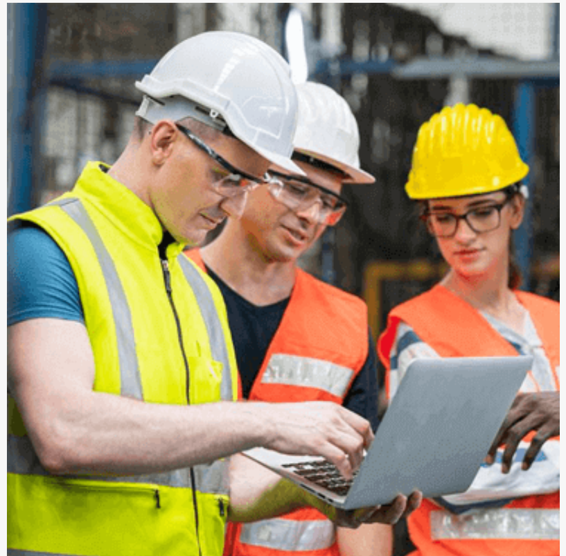
Team using CMMS