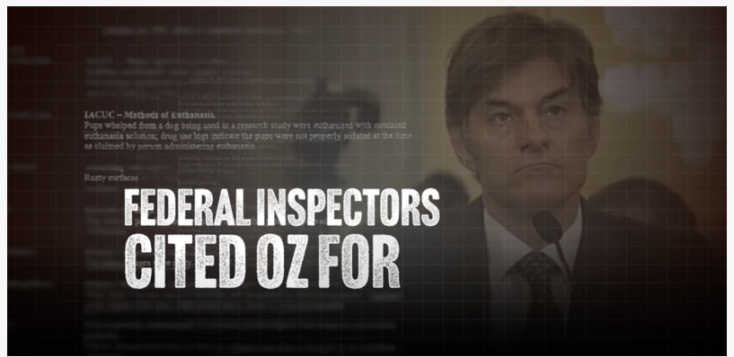
Dr. Oz Ad

University of Columbia. The mistreatment was severe enough to prompt the U.S. Department of Agriculture to issue a rare citation for Animal Welfare Act violations and to fine Columbia University for the abuses. You can see the first ad, which started running today, here.