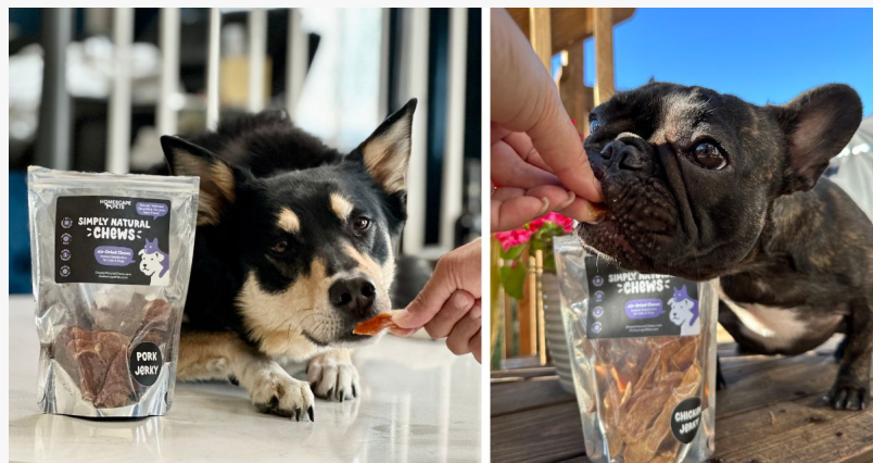
Dogs and Homescape Pets chicken jerky and pork jerky