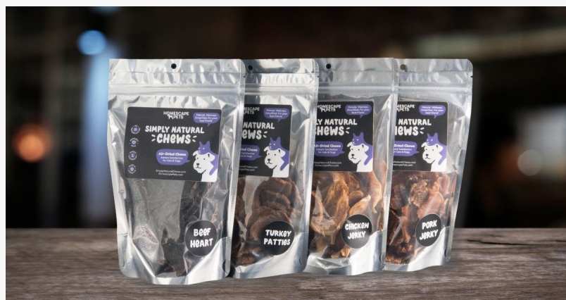
Homescape Pets treats sold in Paws on Chicon, Austin TX: Beef Heart, Chicken Jerky, Pork Jerky, Turkey Patties