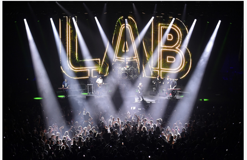
L.A.B Live Show