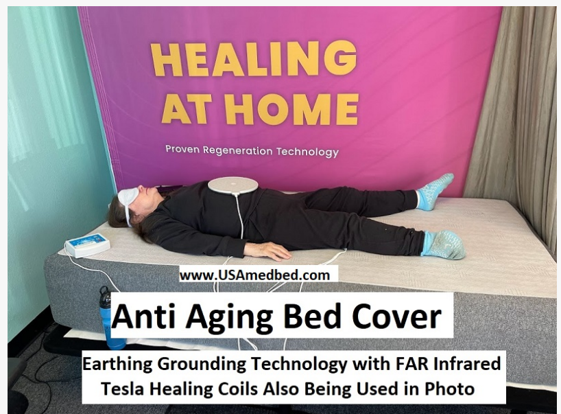
A woman lays down on the Anti Aging bed Cover while using the Tesla healing paddles

When it comes to more powerful med bed-type technologies plasma-based technology is one of the most popular. Plasma is created when gas is charged with enough energy to convert it from gas to plasma. Plasma is what the sun is made of along with lightning and many people including Nikola Tesla have worked with plasma energy for over one hundred years ago. Plasma energy can also be turned into specific frequencies to address very specific cells and health conditions. Many other pioneers including Royal Rife spent years finding the frequencies that cells would resonate at and how plasma could affect the removal of bad cells and promote the health of good cells. The San Diego-based company has a wide variety of plasma-based technology products including "plasma energy spheres" which create a plasma energy field that people can sit into to absorb the plasma energy. Products like the plasma energy spheres are actually creating a live and intelligent