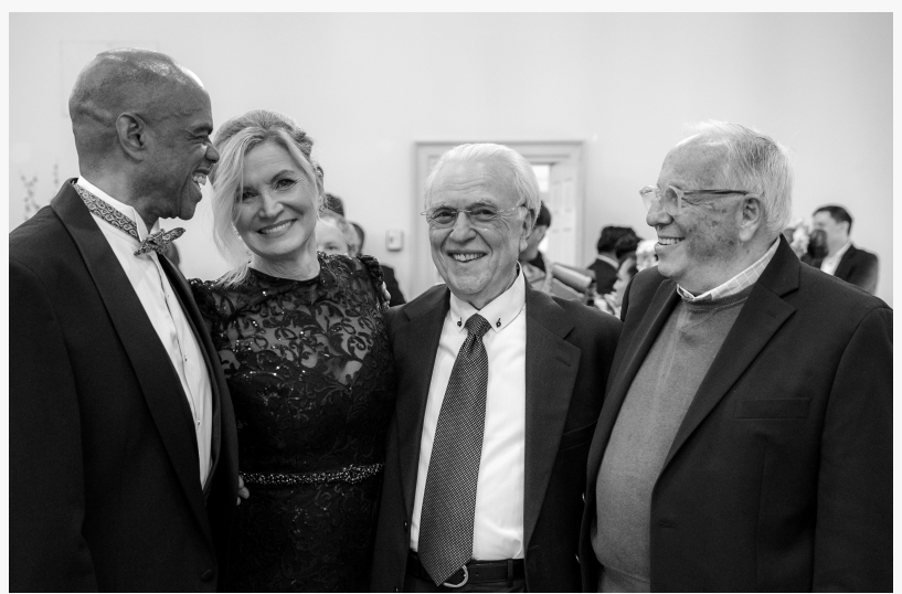
World of Colors Concert