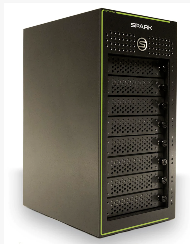
Symply SPARK Thunderbolt RAID array

Axle AI and Symply announce joint solutions at NAB NY booth 1638