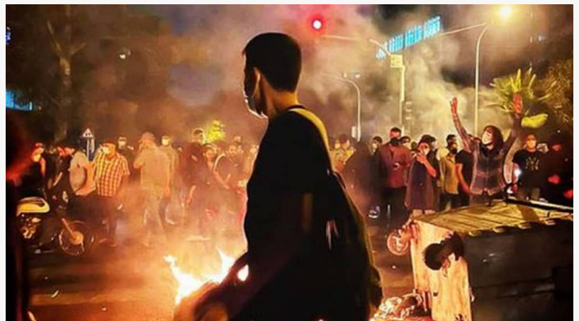
Nationwide protests against the Iranian regime. Iran's protests have up to now expanded to 190 cities and all 31 provinces across the country.