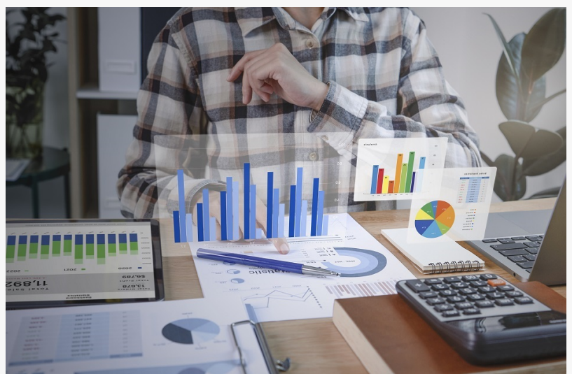
Invoice Maker - Powered by Moon Invoice

Moon Invoice is a simple, slick & handy invoicing accounting app that lets you generate, manage & track invoices & expenses.