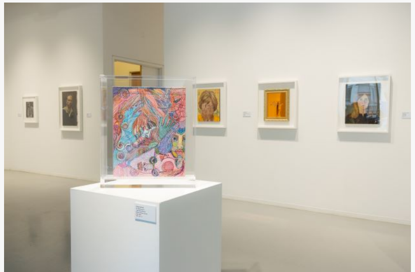
The INSIGHTS exhibition series is intended to raise awareness of Bipolar Disorder and to reduce the stigma associated with this serious illness of the brain by highlighting the creativity that can often accompany this illness.